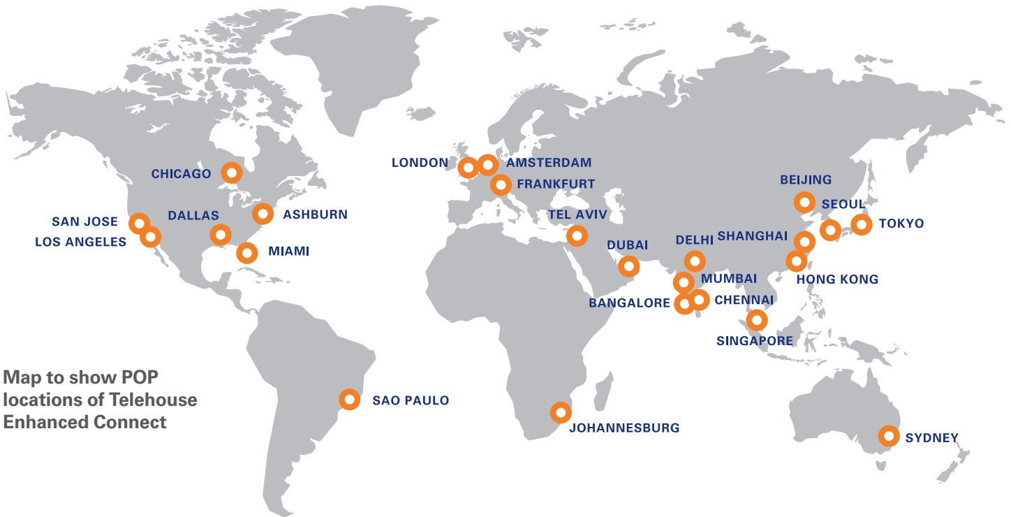
Map to show POP locations of Telehouse Enhanced Connect